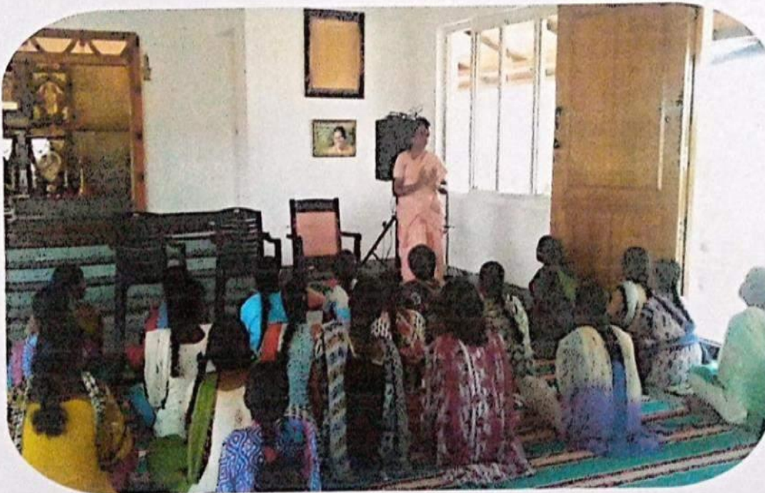
Beneficiaries : 10 th ,12 th and UG students of Literature ,Mathematics and Chemistry .