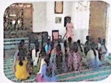
Students in the counseling